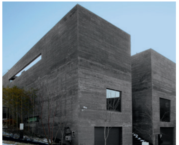
■ A film director's publishing house and residence made of brown fair-faced concrete (a mixture of brown Bayferrox® pigments).