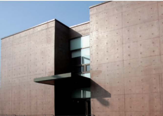
■ Publishing house in Paju with a mixture of browns (based on Bayferrox® pigments).