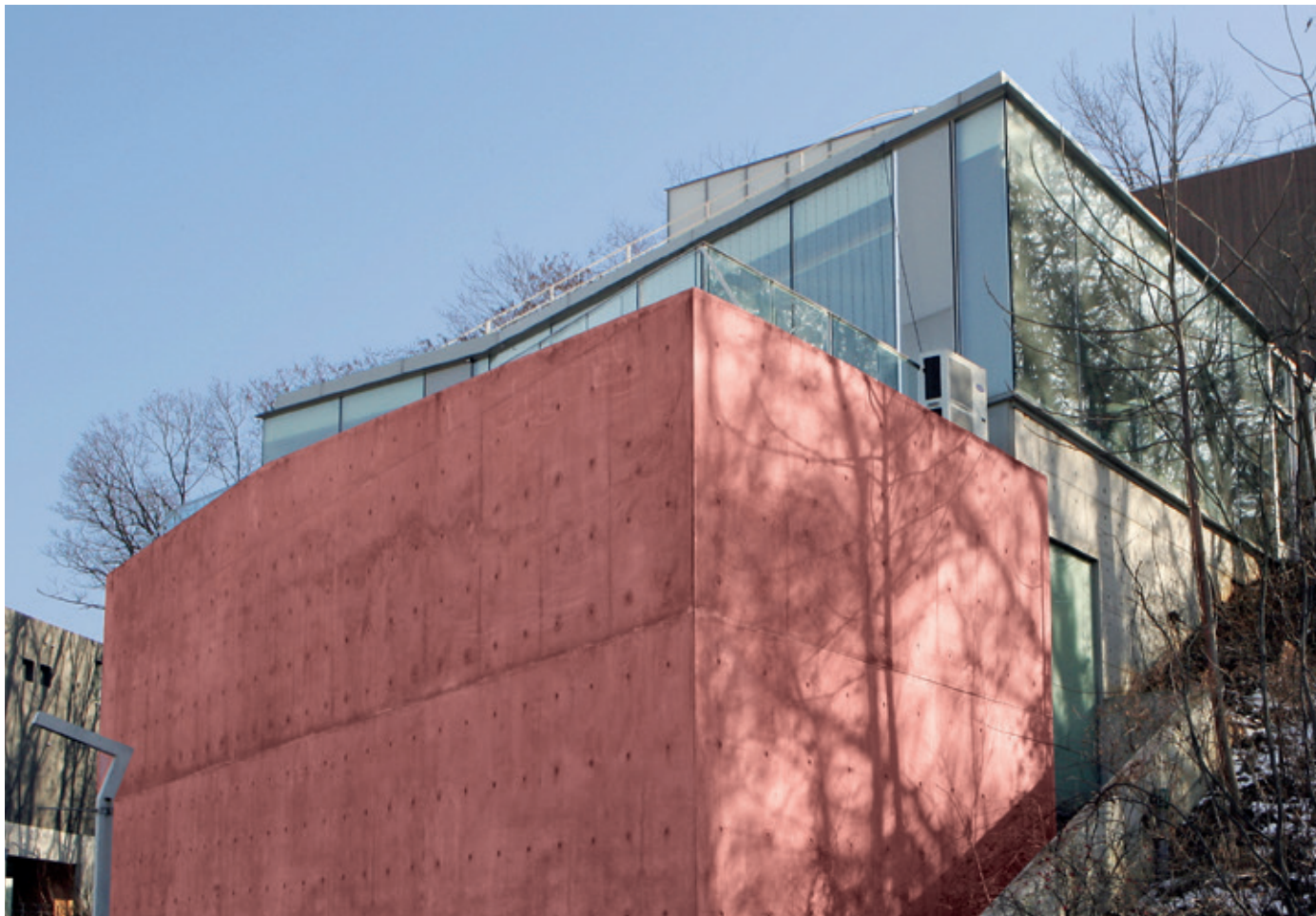
■ The Heewon Gallery, Pink House, in the Heyri Art Village with a pink concrete mix (based on Bayferrox® 130 C).